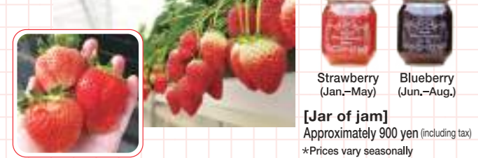
Strawberry (Jan.-May) Blueberry (Jun.-Aug.) [Jar of jam] Approximately 900 yen (including tax) *Prices vary seasonally

[Strawberry souvenir gifts] Approx. 600-2,000 yen (incl. tax) *Prices vary seasonally