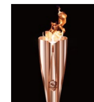
Tokyo 2020 Olympic Torch

The flames lit by the participating municipalities in the relay will be collected into one to create the torch of Chiba Prefecture on Wednesday, August 18, 2021. The Torch Relay will be held in Chiba City. Then, the flame will be sent to the host city, Tokyo.