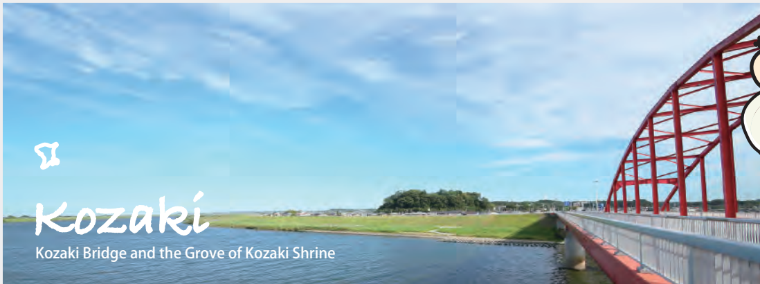
Kozaki Kozaki Bridge and the Grove of Kozaki Shrine