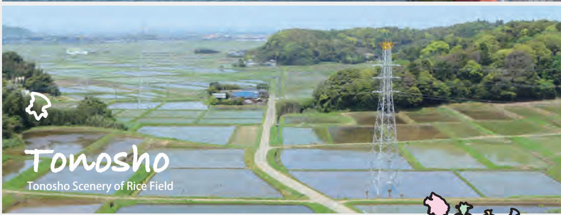
Tonosho Tonosho Scenery of Rice Field