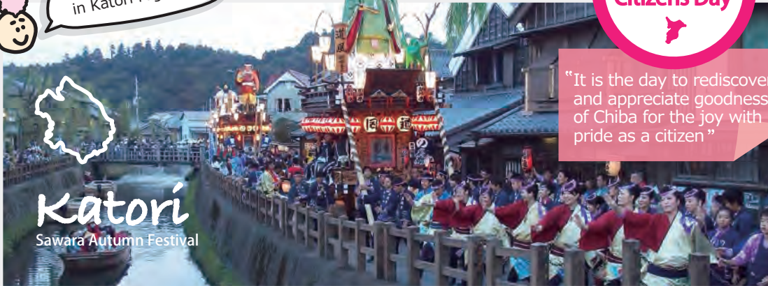
Katori Sawara Autumn Festival

"It is the day to rediscover and appreciate goodness of Chiba for the joy with pride as a citizen"