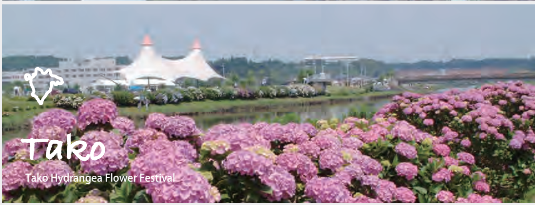
Tako Tako Hydrangea Flower Festival