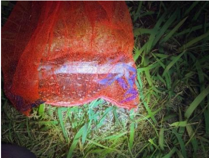
Crab that was caught